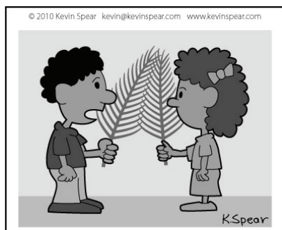
"I thought Palm Sunday was when everyone went to Florida for spring break."

Mount Calvary is the academy of love. ( St. Francis de Sales )